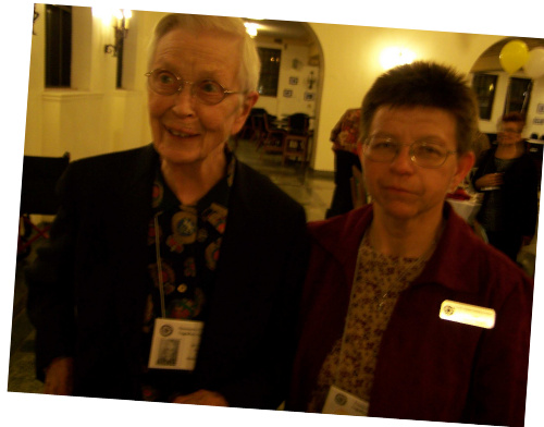
The Money Counters