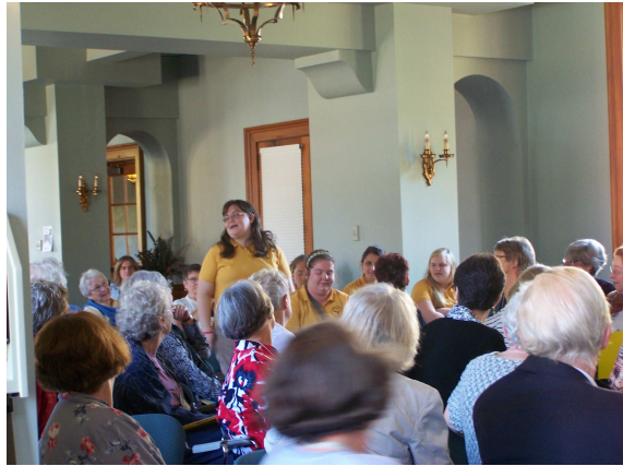
The General Meeting in Alverna Center