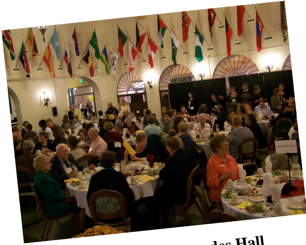
The Banquet at Lourdes Hall

Reunion weekend was a beautiful fall weekend in Winona. Nearly two hundred alumnae returned to campus for the festivities.