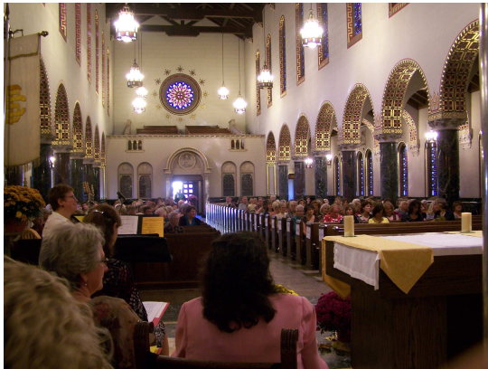
Mass in the Beautiful Chapel